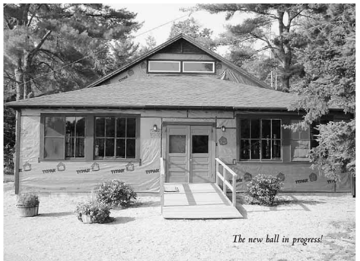
The new hall in progress!